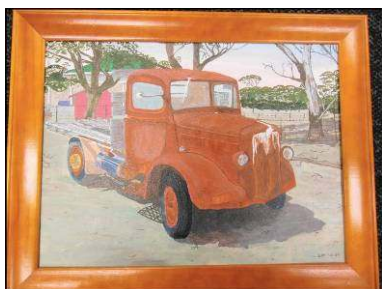
Old Abandoned Truck

Pam has asked to include a picture or two of some original paintings