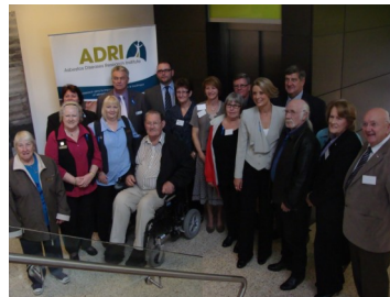
Asbestos Victim groups from around Australia, with NSW Premier Kristina Keneally.

At the invitation of SafeWork SA and the NSW Cancer Institute we attended the launch of the Mesothelioma Register at the Bernie Banton Centre - Institute for Asbestos Research, located at Concord Hospital, Sydney