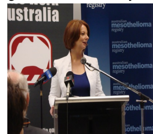
Julia Gillard launched the Register

After the launch, we attended a forum where we were able to make suggestions for improving the collection of data.