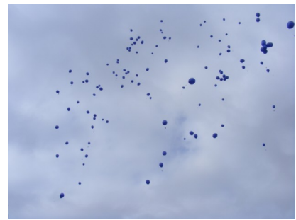
Sky full of blue memorial balloons

Following the ceremony, some of us walked to Victoria Square for the Rally (despite the rain, many attended).