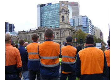
Some of the many workers

At the invitation of SafeWork SA and the NSW Cancer Institute we attended the launch of the Mesothelioma Register at the Bernie Banton Centre - Institute for Asbestos Research, located at Concord Hospital, Sydney