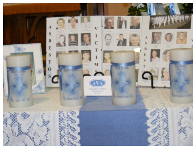
AVA's candles and photos