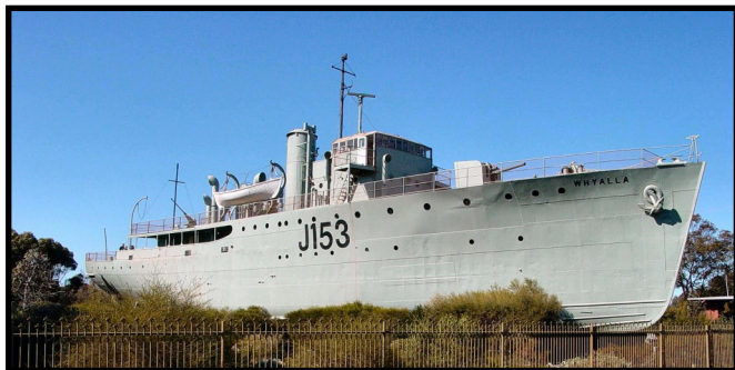
By Photo taken and supplied by Brian Voon Yee Yap :HAMS Whyalla