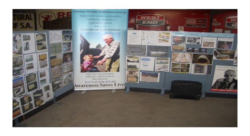
Part of one of our displays in a regional area