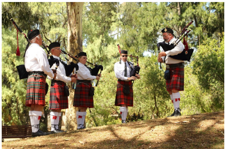
OUR WONDERFUL PIPERS